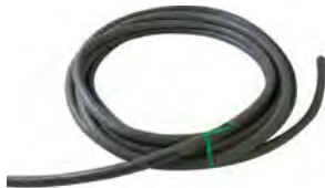
12/2 AWG WIRE