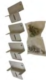
Z Brackets with Mounting Hardware